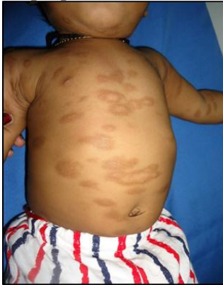
Figure 1. Clinical photograph showing multiple erythematous plaques on the chest and abdomen.