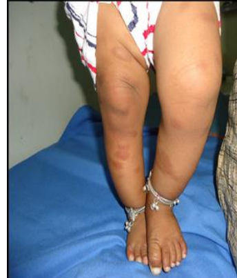
Figure 2. Clinical photograph showing multiple erythematous plaques over both the lower limbs.